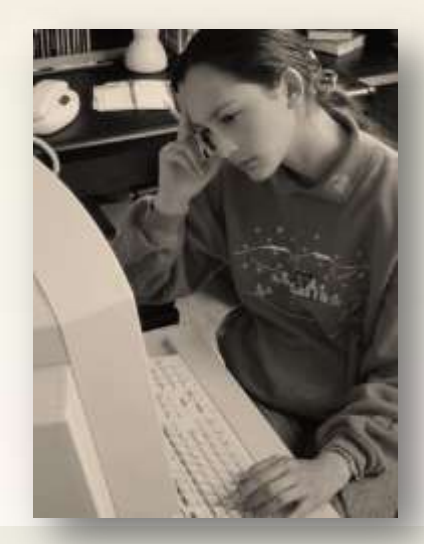
Technology is changing how we work and relate.