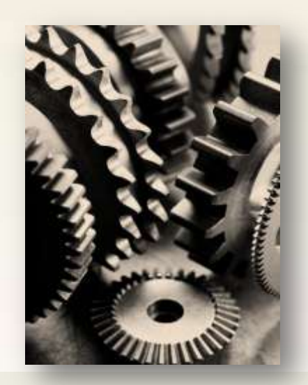
More pieces need to work together more than before.