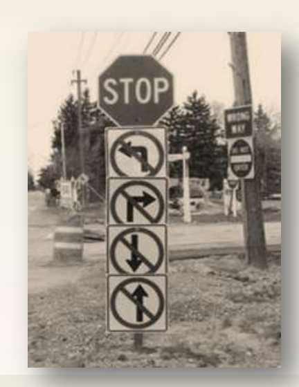
It can be hard to find your way.